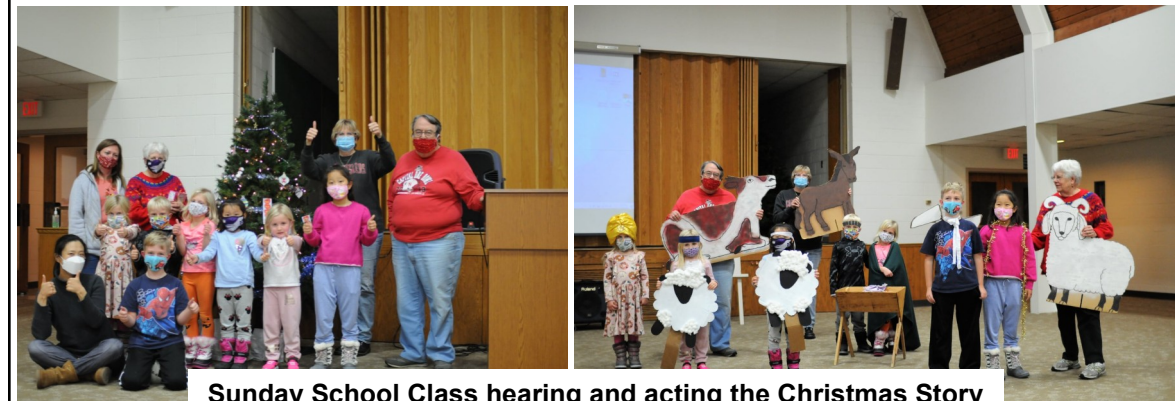
Sunday School Class hearing and acting the Christmas Story