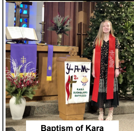
Baptism of Kara